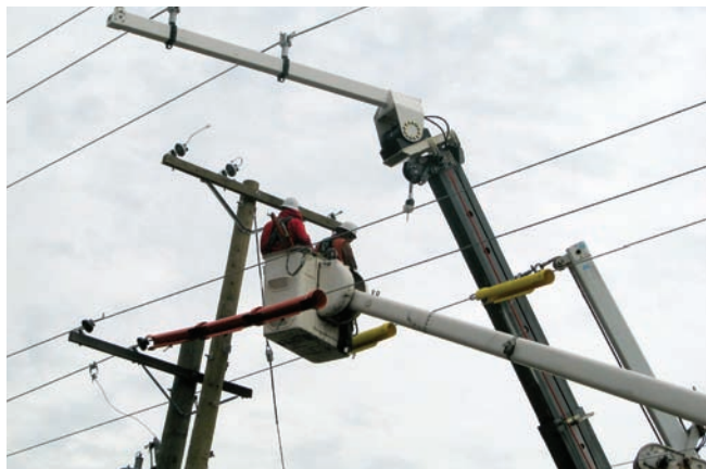
Live Line Solution's Insulated Conductor Support Jibs (ICSJ) and LinePro HA keep linemen safe and increase productivity by incorporating radio-controlled, hydraulic-actuated articulation.